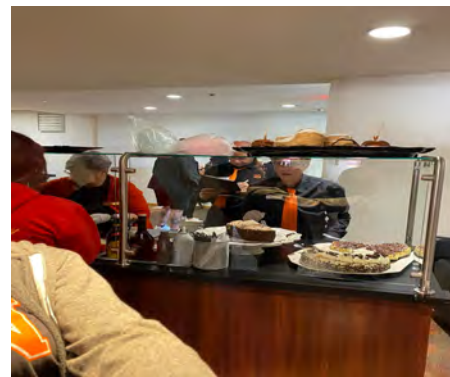
The "Suite" Life....Bengals Game 2021